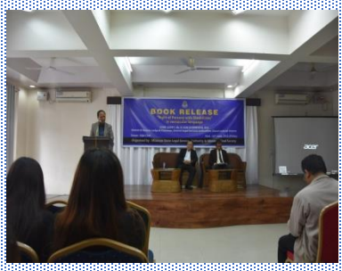
Vignettes from the programme organised by Mizoram State Legal Services Authority

• From 14.05.2023 till 14.06.2023, Jharkhand Legal Services Authority organised an intensive campaign on Mediation titled "Man Ka Milan Pakhwara". Under this Campaign, special Awareness Programmes on Mediation were organized by all DLSAs through their Legal Aid Clinics, Front Offices and Mediation Centres. Audio-Visual presentations on Mediation, showcasing the success stories were also played during these Awareness Programs. During the campaign, many pending cases were settled through Mediation.