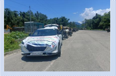
Vignettes from the programme organised by Arunachal Pradesh State Legal Services Authority

On 16.06.2023, Mizoram State Legal Services Authority organised an Awareness Program on NDPS Act at Aijal Club, Aizawl to discuss the problem of Drug Abuse in Mizoram and the ways to tackle the problem and rehabilitate the victims of drug abuse. The programme was chaired by Ld. Member Secretary, MSLSA, Ld. District & Session Judge, District Court, Aizawl also graced the occasion. The program also witnessed the release of a Handbook on Rights of Persons with Disabilities under the Rights of Persons with Disabilities Act, 2016 and the Rights of Persons with Disabilities Rules, 2017.