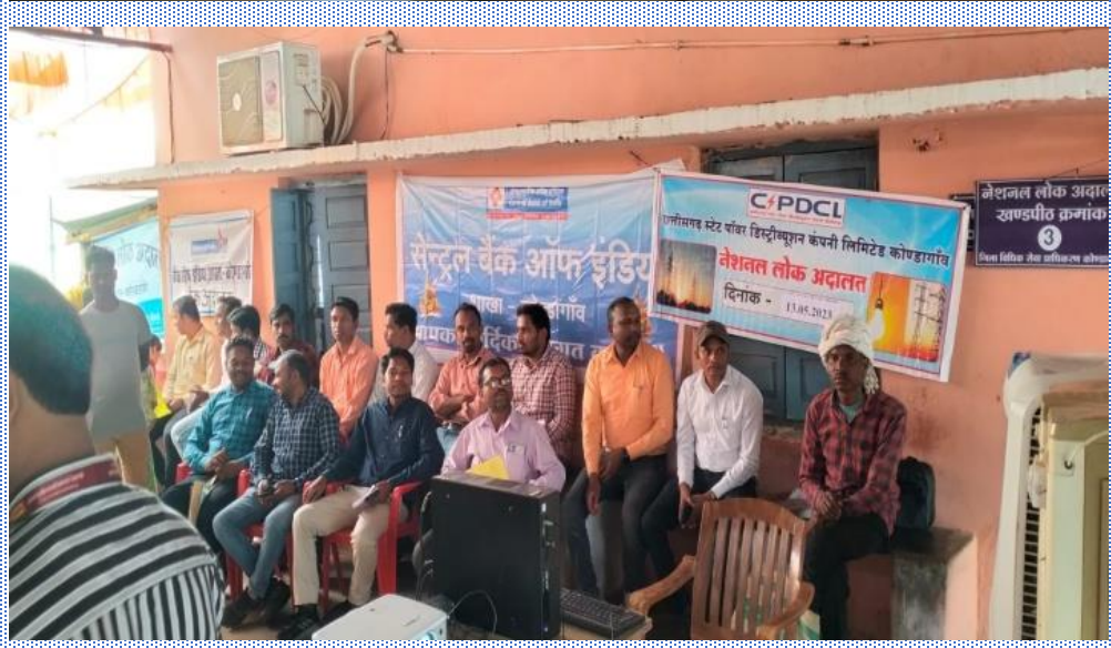
Vignette from 2nd National Lok Adalat in Chhattisgarh