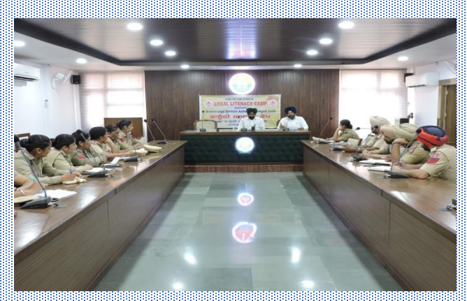
Vignette from Training Programmes organised by Punjab SLSA