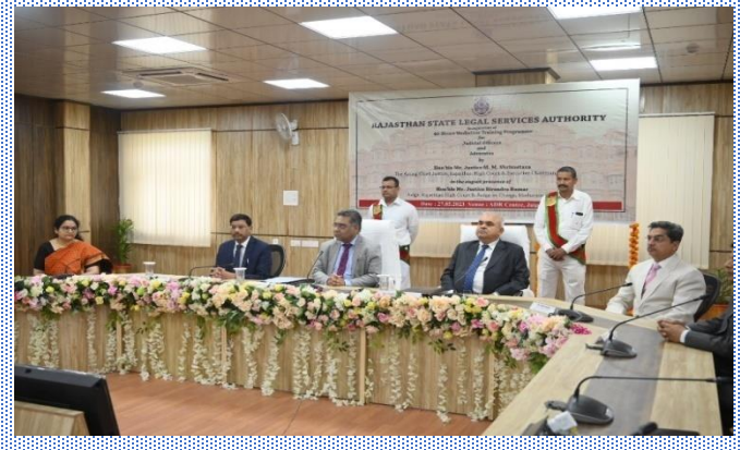
Vignettes from Mediation organized by Rajasthan SLSA