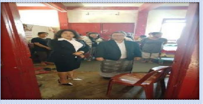
Vignettes from the programme at District Prison and Correctional Home, Shillong, Meghalaya