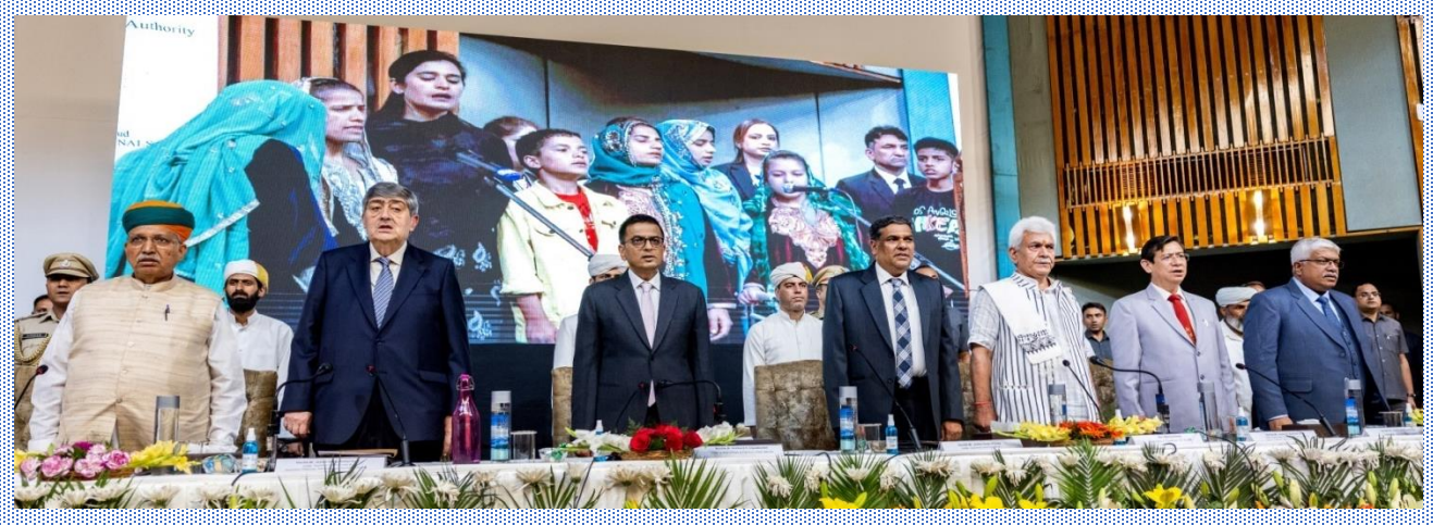
RENDITION OF THE NATIONAL ANTHEM IN THE INAUGURAL SESSION

Shri Arjun Ram Meghwal, Minister of State (Independent Charge), Ministry of Law and Justice, Union of India, while lauding the initiatives of NALSA also highlighted the steps taken to overhaul the functioning of Indian Justice Delivery System and he also laid emphasis on strengthening the Legal Aid Defense Counsel System.