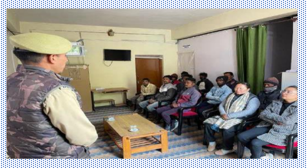
Vignette from the programme of Khaltsi TLSC

In May, 2023, Harvana State Legal Services Authority (HSLSA) launched mobile with Public Address Speakers etc.) as a part of its outreach activities so that Legal Aid Counsels and Para Legal Volunteers (PLVs) can go to far- flung areas to laws. spread awareness about various beneficial schemes launched by the government Through these Mobile Vans, both prerecorded and live messages shall be relayed to people to educate them on various issues of socio- legal significance for the common man. In May, 2023, HSLSA organized 27 camps in which the services of these mobile vans were utilized. Around 2,894 persons were reached out to through these camps.