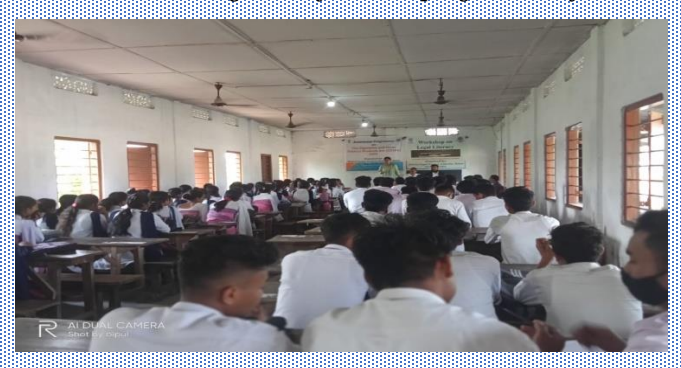
Vignette from the programme of DLSA, Baksa, Assam

DLSA. Baksa. Assam organised Awareness Program on "The Cigarettes and Other Tobacco Products (Prohibition of Advertisement and Regulation of Trade and Commerce, Production, Supply and Distribution) Act, 2003" on 31.05.2023 at Legal Literacy Club, Barama Higher Secondary School, Baksa. The students were informed about the harmful effects of consuming tobacco and provisions regarding tobacco advertising and consumption.