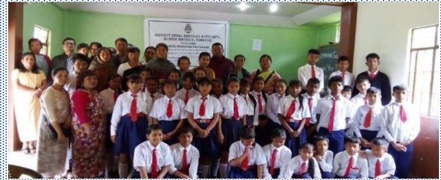
Vignettes from programme at Ri Bhoi Dist., Meghalaya

On 01.05.2023, South-West DLSA, Delhi, in collaboration with the Jan Sahas Foundation, to celebrate International Labor Day, established Helpdesks for Laborers to facilitate the issuance of their E-Shram Cards/ Labor Cards, so that the construction workers may easily avail the benefits provided by the Delhi Construction Board under the Building and Other Construction Workers' Fund.