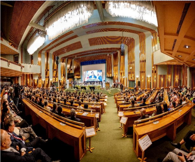
RELEASE OF THE MANUAL FOR DISTRICT LEGAL SERVICES IN THE CONFERENCE HALL

Shri Arjun Ram Meghwal, Minister of State (Independent Charge), Ministry of Law and Justice, Union of India, while lauding the initiatives of NALSA also highlighted the steps taken to overhaul the functioning of Indian Justice Delivery System and he also laid emphasis on strengthening the Legal Aid Defense Counsel System.