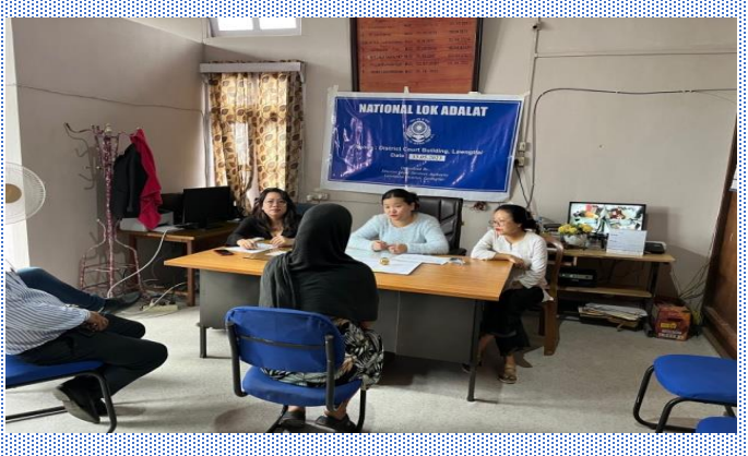
Vignette from 2nd National Lok Adalat at Lawngtlai, Mizoram