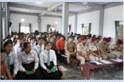
Vignettes from the programme at Mamit District Jail, Mizoram

• DLSA, East Khasi Hills District, Shillong in collaboration with the Meghalaya State Legal Services Authority, organized a Legal Awareness Programme on the 28.05.2023 at District Prison and Correctional Home, Shillong for the female jail inmates. Apart from telling them about the availability of free legal services provided by the Legal Services Authorities, the inmates were also told about the importance of menstrual hygiene and ways to maintain the same. After the session, sanitary pads were also distributed to the inmates by the Ld. District & Sessions Judge cum Chairperson, DLSA, Shillong and the Chief Judicial Magistrate cum Secretary, DLSA, Shillong.