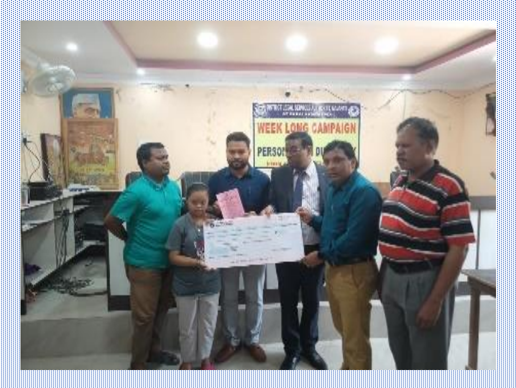
Vignettes from the campaign launched by Odisha State Legal Services Authority