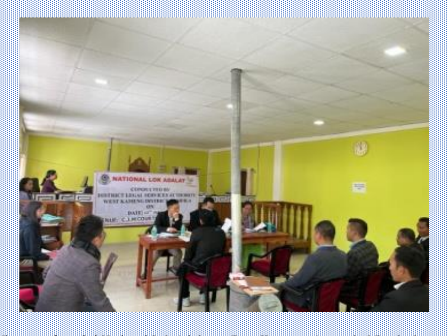
Vignettes from 2^{nd} National Lok Adalat at East Kameng, Arunachal Pradesh