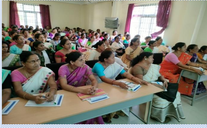
Vignettes from the Refresher Training Programmes organised by DLSA Golaghat, Assam