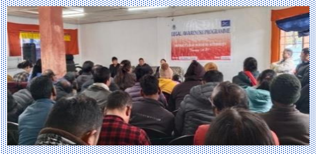
Vignette from the programme of DLSA, Tawang

On 26.05.2023, the TLSC, Khaltsi, Ladakh, organized a Legal Literacy Camp for laborers at the Munsif Court Complex and the same was chaired by Chairman, TLSC Khaltsi. The camp was attended by laborers working/living nearby, PLVs, and the Court Staff. During the session, the participants were made aware about their fundamental and legal rights and duties and they were also apprised about the various grievance redressal forums available.