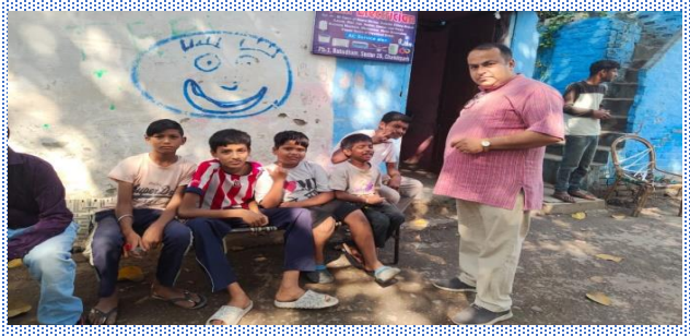
Vignettes from the Programme organised by Chandigarh DLSA

In May, 2023, Harvana State Legal Services Authority (HSLSA) launched mobile with Public Address Speakers etc.) as a part of its outreach activities so that Legal Aid Counsels and Para Legal Volunteers (PLVs) can go to far- flung areas to laws. spread awareness about various beneficial schemes launched by the government Through these Mobile Vans, both prerecorded and live messages shall be relayed to people to educate them on various issues of socio- legal significance for the common man. In May, 2023, HSLSA organized 27 camps in which the services of these mobile vans were utilized. Around 2,894 persons were reached out to through these camps.