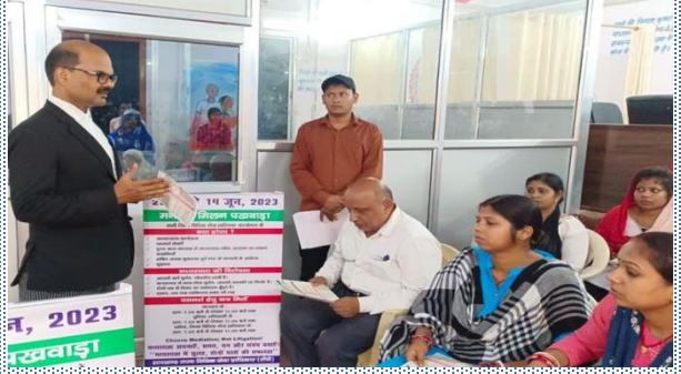
Vignettes from the "Man ka Milan Pakhwara" campaign of Jharkhand State Legal Services Authority